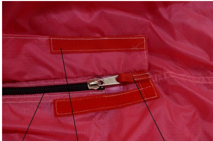
zip fastener zip fastener cover with Velcro zip fastener Velcro securing